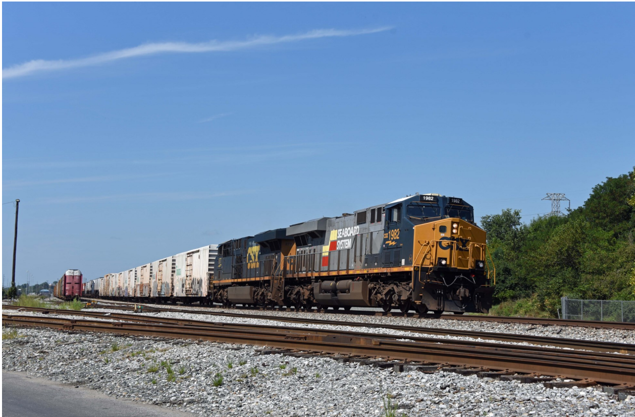
The CSX "Seaboard System" heritage locomotive, ES44AC number 1982, leads Jacksonville-North Bergen intermodal train IO32 running east through Wilsmere Yard on Aug. 27, 2023. CSX has released 6 heritage painted locomotives.